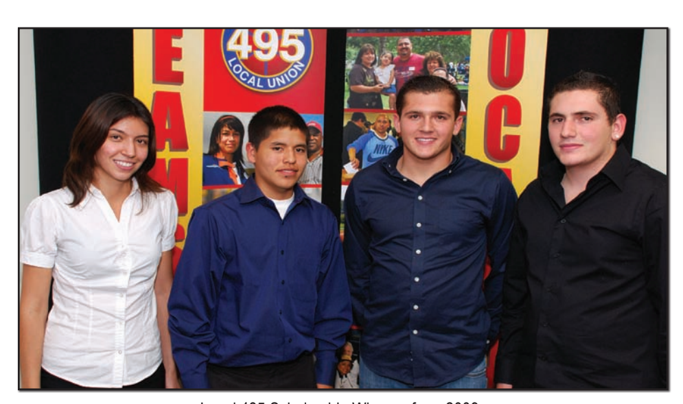
Local 485 Scholarship Winners from 2009

In addition to the Local 495 Scholarship, members are encouraged to explore other Teamster scholarship programs provided through Joint Council 42 (www. teamstersjc42.com) and the International Brotherhood of Teamsters (www.teamster.org).