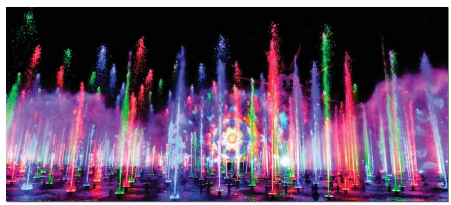
"The World of Color" is a water spectacular that intertwines more than 1,000 jets of water, color, fire, music and your favorite Disney characters in a 26-minute spectacular show over Paradise Bay.

This dazzling new addition to the park requires a FASTPASS but means extra hours and more CONTINUED on next page