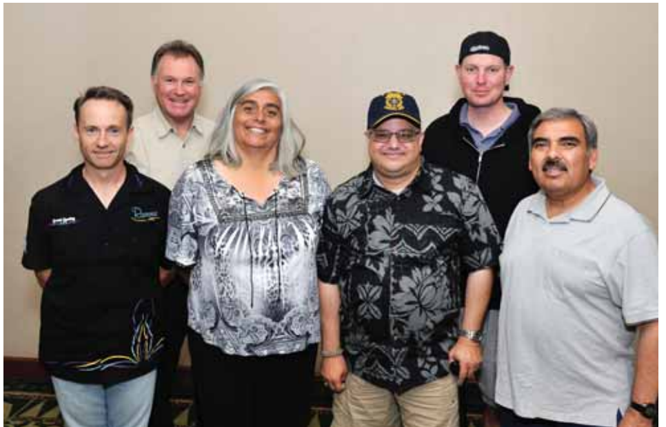
Shop stewards representing DISNEYLAND