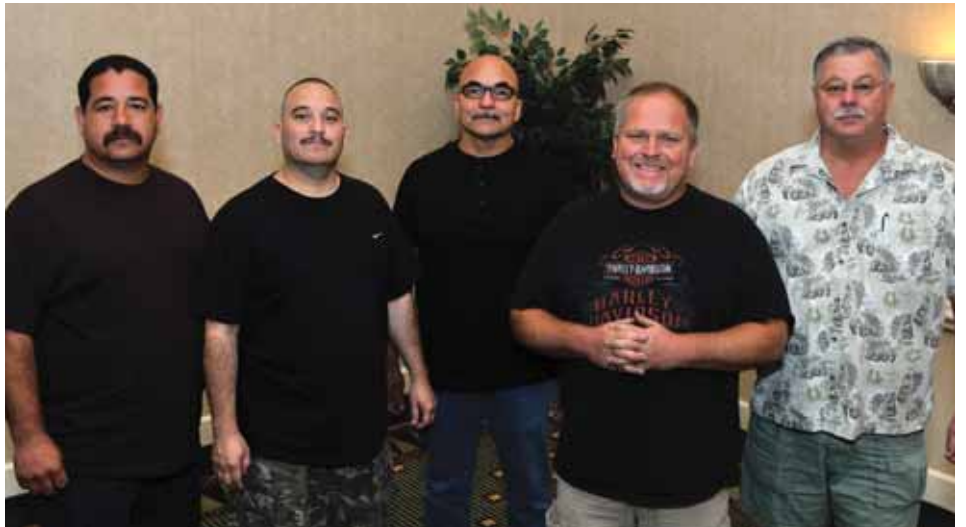
Shop stewards representing PENSKE