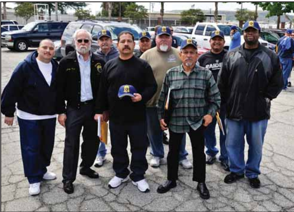
Stewards and members of Local 495 joined 1,400 Southern California Teamsters in a crucial political action seminar.

The number one priority is to get members and their families to register or re-register if they have moved, and request vote-by-mail (formerly absentee) ballots. Voting by mail is more convenient and improves the chances of a vote actually being cast.