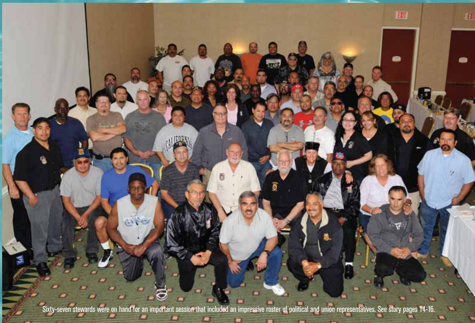
Sixty-seven stewards were on hand for an important session that included an impressive roster of political and union representatives. See story pages 14-16.

Contact Your Business Agent or Shop Steward for Voter Registration Forms