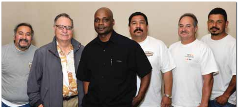
Shop stewards from UPS