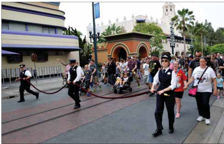
Local 495 members managing the crowd