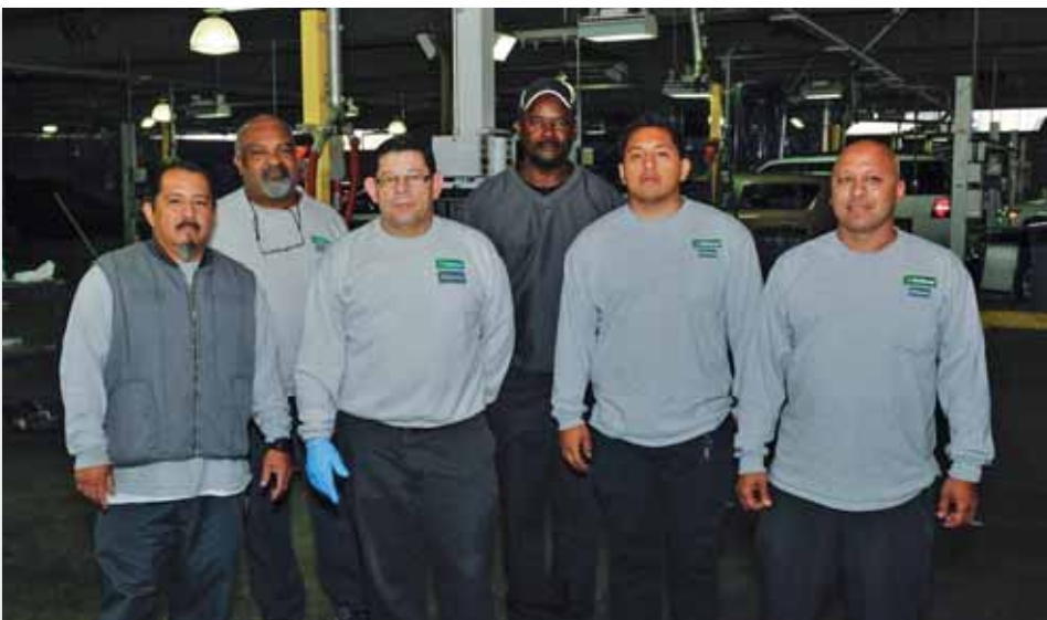
Local 495 members National Alamo