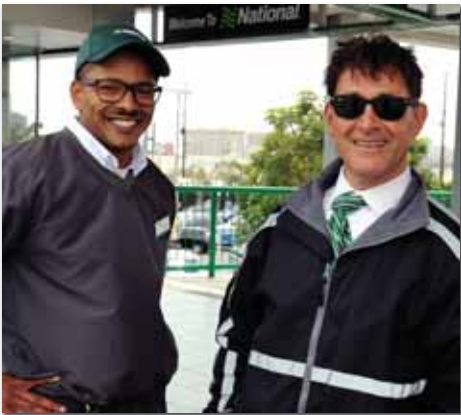
Local 495 members - National