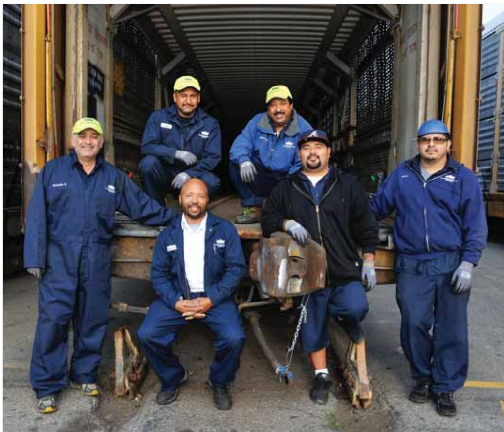
Members of Local 495 at WWL