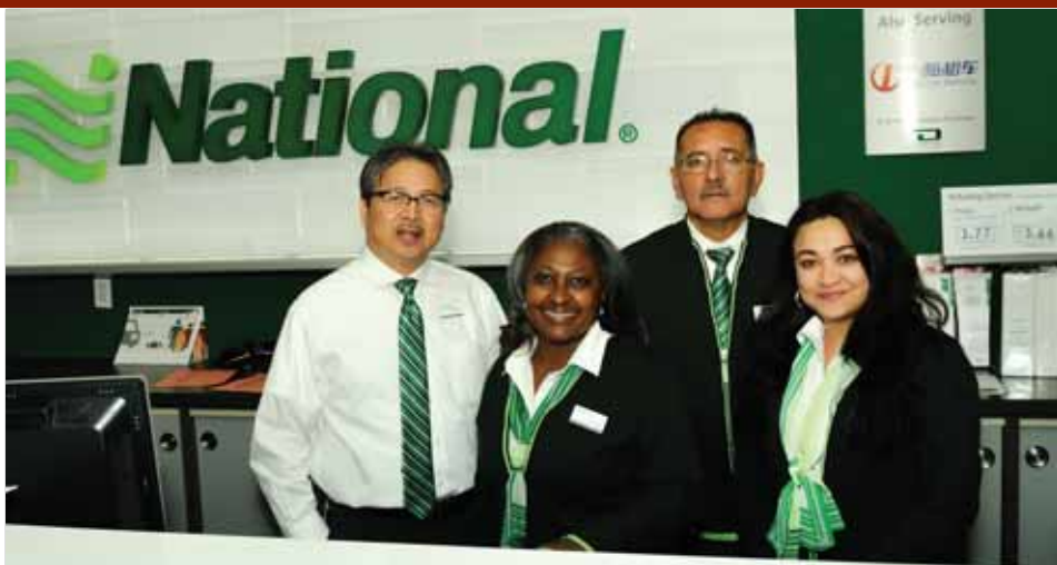
Local 495 members - National