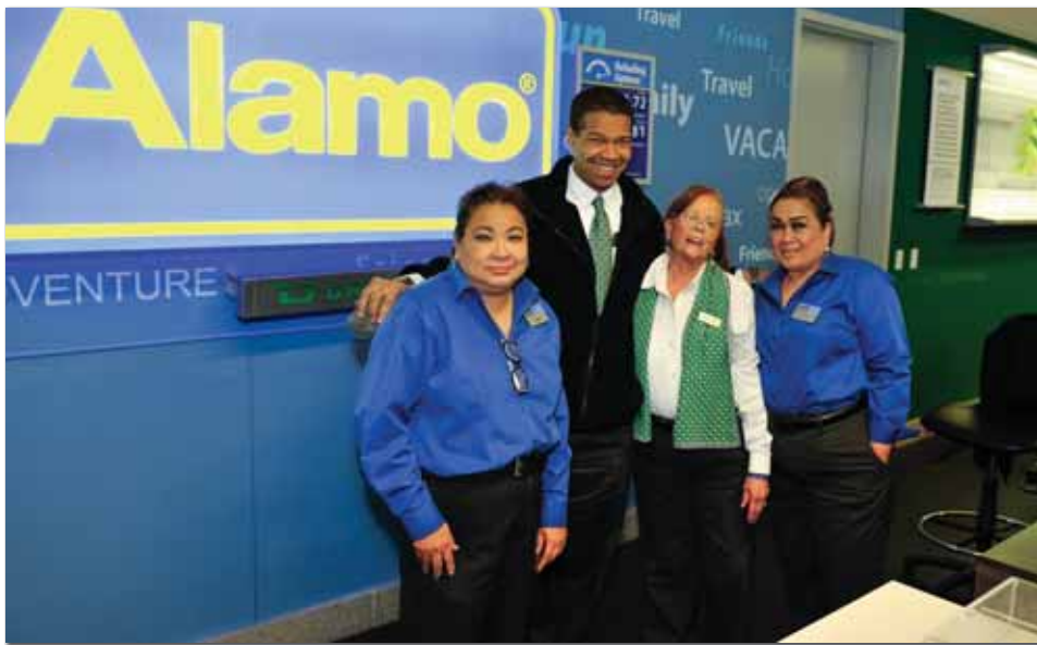
Local 495 members - National/Alamo