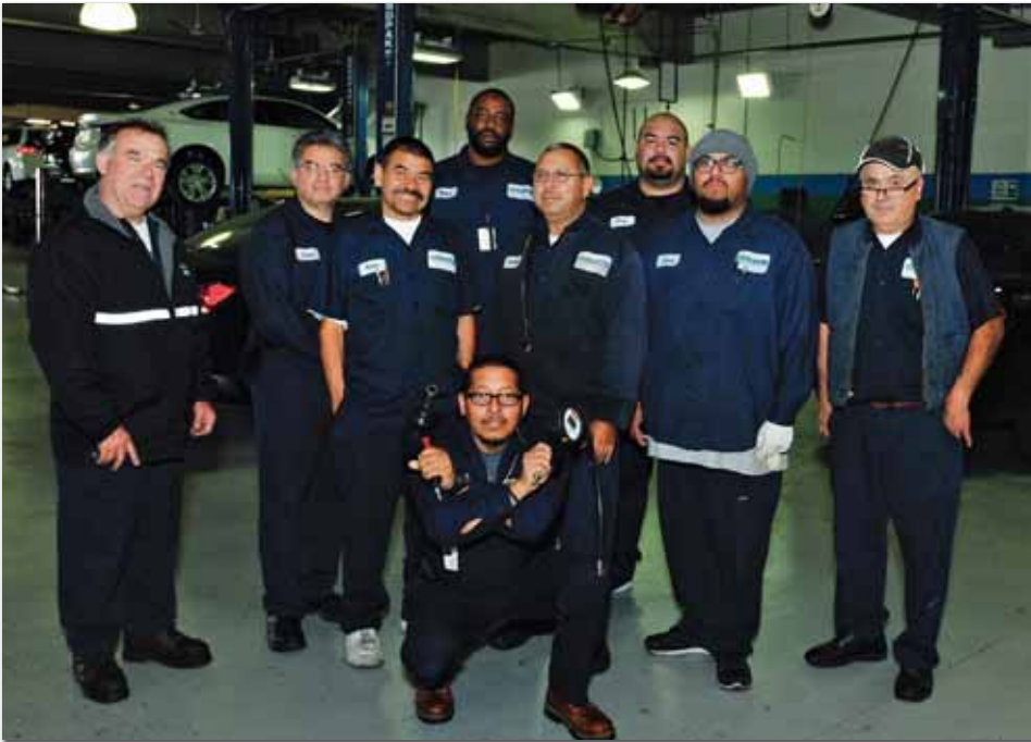
Local 495 members National Alamo