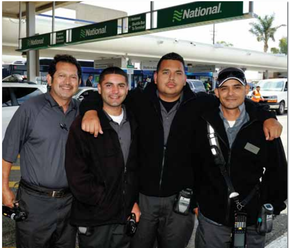
Local 495 members - National